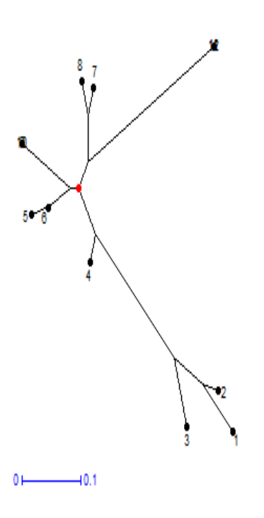
Figure 1: Darwin's radii graph