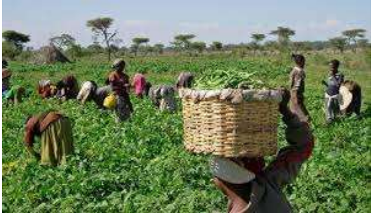
Figure 2: Nigerian Farmers harvesting their crops [15]

The advantages that come with IoT are unquantifiable, however, most Nigerian farmers and youths have not embraced agriculture and the implementation of the Internet of Things into their farming profession due to inadequate awareness and the cost of implementing IoT. Farmers are encouraged to leverage IoT to ensure improved water conservation, improved livestock farming, reduced environmental stress, improved soil management, and erosion control.