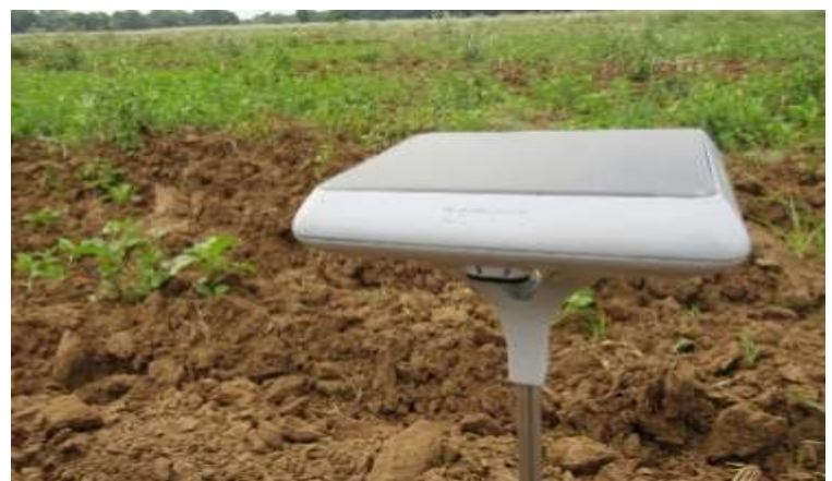
Figure 3: Zenvus device