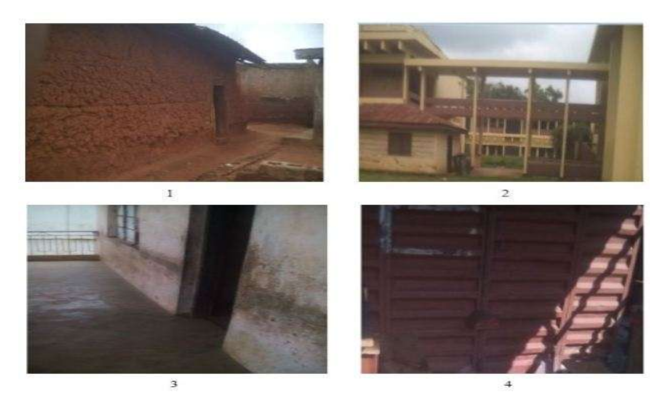
Figure 2. (1- Mud building, 2- Concrete building, 3- Brick building, 4- Metal building)