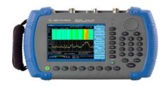
Figure 1 Agilent Handheld Spectrum Analyzer

The measurement campaign was conducted using the N9342C Agilent Handheld Spectrum Analyzer (see figure 1). The analyzer comes with a radio frequency antenna that operates within the frequency range of 100 KHz and 7 GHz as well as a geo-positional system (GPS) receiving antenna attachment for determining GPS coordinates of locations. By specifying the desired frequency band, antenna sensitivity and units of measurement, in dBm, dB or Watt, measurements of signal power level outside and inside four different types of wall namely concrete, cements bricks (popularly called bricks), mud and metal were taken in several locations and at different times. These types of wall represent the major categorization of building materials used in a typical ancient city or urban centre in West Africa. The measurements were carried out in the city of Ilorin, the administrative and political headquarter of Kwara, one of the thirty-six states of Nigeria. Figure 2 provides pictorial samples of each of the building walls while table 1, provides a brief summary of the description of the various measurement locations and building wall materials.